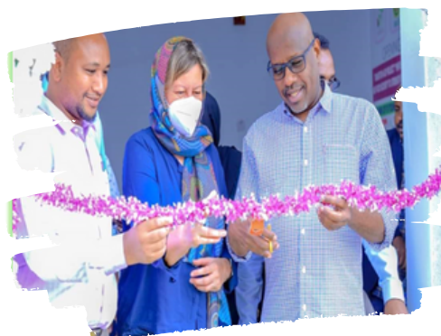
Figure 14 Director of MOES, deputy mayor of Berbera