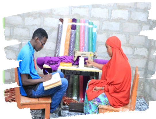
Figure 22 TVET Trainees Who Successfully Commenced Work