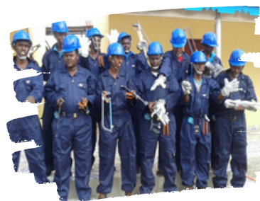
Figure 12 Men trainees in photo group