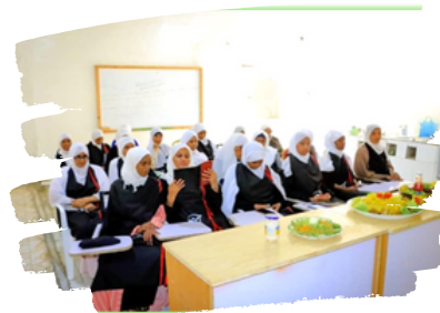
FIGURE 20 In YOVENCO TVET Center