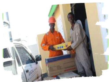
Figure 10 Trainees receiving tool kit

The objective of the vocational training was to Improve employment access for poor youth, persons with disabilities, and IDPs, with equal gender composition through the provision of IBTVET and employable skillset.