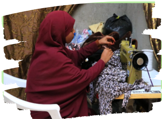
Figure 21 TVET Trainees Who Successfully Commenced Work

YOVENCO Technical and Vocational Institute, in partnership with NRC, has trained refugees, asylum seekers, and host communities on vocational skills in Berbera. The total trainees were 51 (40 female, 11 male), and they were trained in beautification, cooking, steel-fixing, and tailoring.