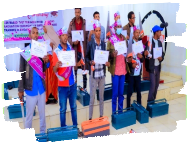
Figure 16 Trainees receiving certificates of completion