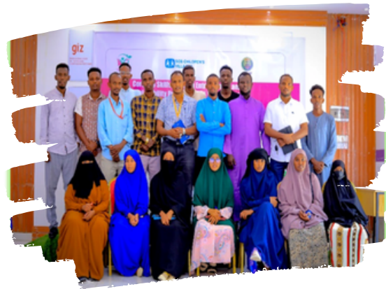
Figure 18 Trainees, YOVENCO and Partner Officials