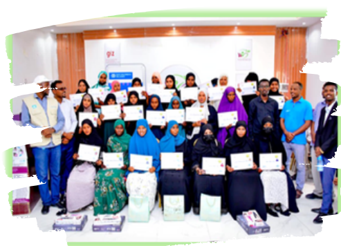
Figure 6 Photo group of graduated trainees