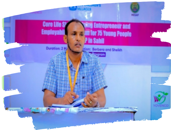
Figure 17 MESAF Regional Coordinator

Upon the completion of the sessions, the trainees are divided into two groups based on their interests; one group for the employability training track and the other group for the entrepreneurship training track.