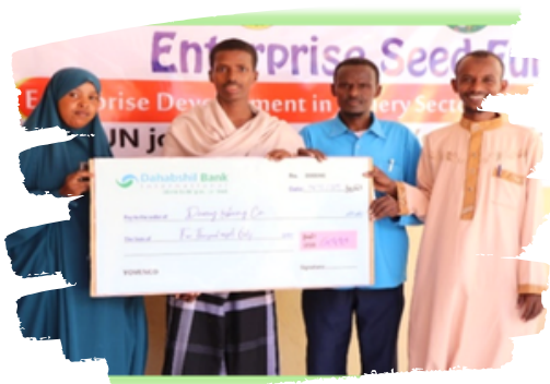
Figure 8 Group cooperative being awarded the capital cheque

The project offered business management skills, micro-grants/ revolving funds management practices, and accelerated business development in Berbera. The project has also granted $30,000 capital through bank accounts for six youth cooperatives as starting capital for their own businesses in the fishery sector in Berbera.