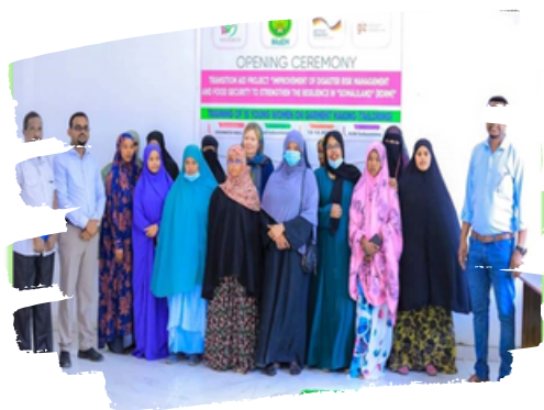
Figure 13 Photo group of the opening ceremony

With the partnership of GIZ, YOVENCO Technical and Vocational Training Institute is offering training in a boarding setting (Girls Exclusive). The trainees were selected from Qoryaale, Koosaar IDP, Ali Husein IDP, Cadaadlay, Dacar budhuq, Abdaal, Mandheera, Laasciidle, Go'da Wayn, and Tuulo dhibiijo villages.