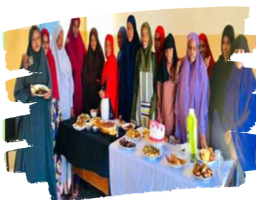
Figure 11 Women trainees in photo group