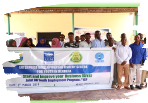
Figure 9 Trainees in photo group