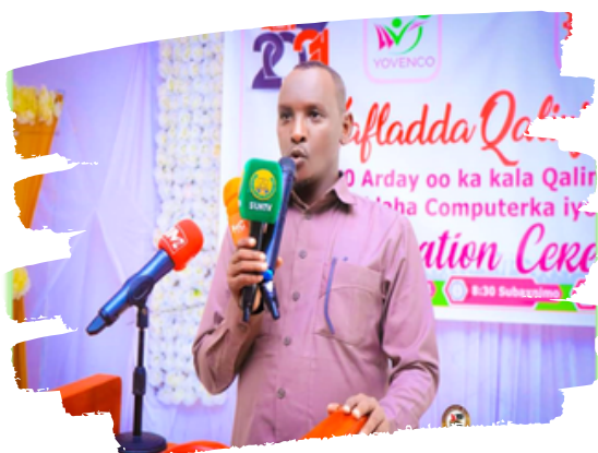
Figure 23 BMA Executive Secretary Giving Speech During The Ceremony

YOVENCO Technical and Vocational Institute also provides self-funded vocational training courses in computer, and electrical installation, digital skills, and cooling system repair to the youth, women, and adults.