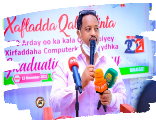
Figure 24 Mayor Of Berbera Giving Speech At TVET Graduation Ceremony