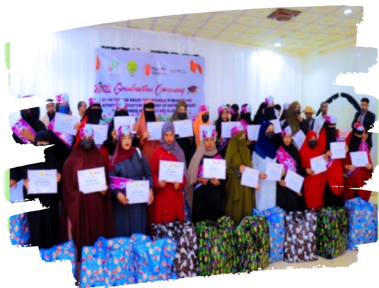
Figure 15 Women trainees receiving certificates of completion

YOVENCO Technical and Vocational Institute trained, through EBTvet enterprises, 100 (60 female, 40 male) trainees from Erigavo and El Afweyn. In addition to that, the project helped increase the knowledge and skills of 14 CBAHWs from Erigavo, El Afweyn, and Gar'adag through the provision of refresher training and equipped them with kits.