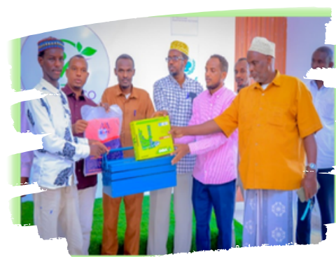
Figure 7 Tool kits granted to trained youth