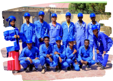
FIGURE 19 In YOVENCO TVET Center

The total number of trainees is 40 (21 female, 19 male) and they are trained in level 1 cooling System repair and hospitality management.