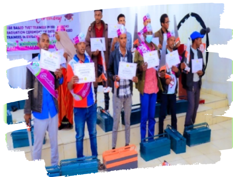
Figure 16 Trainees receiving certificates of completion