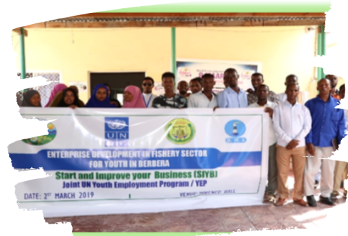
Figure 9 Trainees in photo group