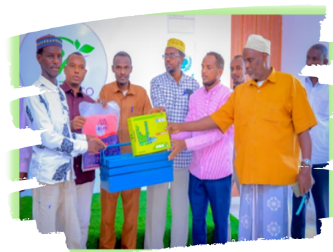
Figure 7 Tool kits granted to trained youth