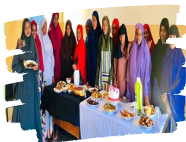
Figure 11 Women trainees in photo group