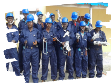
Figure 12 Men trainees in photo group