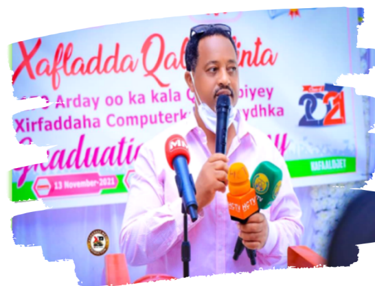
Figure 24 Mayor Of Berbera Giving Speech At TVET Graduation Ceremony