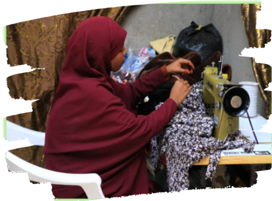
Figure 21 TVET Trainees Who Successfully Commenced Work

YOVENCO Technical and Vocational Institute, in partnership with NRC, has trained refugees, asylum seekers, and host communities on vocational skills in Berbera. The total trainees were 51 (40 female, 11 male), and they were trained in beautification, cooking, steel-fixing, and tailoring.