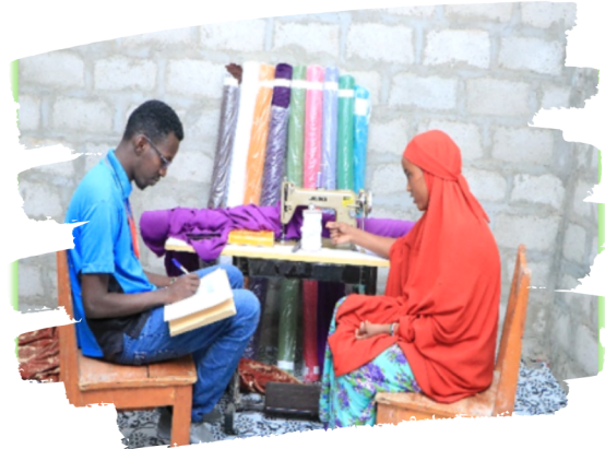
Figure 22 TVET Trainees Who Successfully Commenced Work