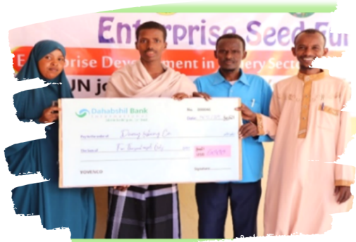
Figure 8 Group cooperative being awarded the capital cheque

The project offered business management skills, micro-grants/ revolving funds management practices, and accelerated business development in Berbera. The project has also granted $30,000 capital through bank accounts for six youth cooperatives as starting capital for their own businesses in the fishery sector in Berbera.