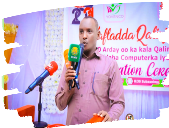
Figure 23 BMA Executive Secretary Giving Speech During The Ceremony

YOVENCO Technical and Vocational Institute also provides self-funded vocational training courses in computer, and electrical installation, digital skills, and cooling system repair to the youth, women, and adults.