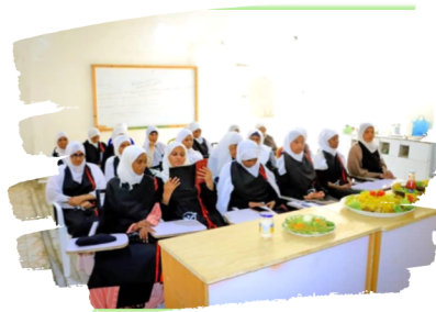
FIGURE 20 In YOVENCO TVET Center