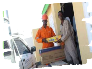
Figure 10 Trainees receiving tool kit

The objective of the vocational training was to Improve employment access for poor youth, persons with disabilities, and IDPs, with equal gender composition through the provision of IBTVET and employable skillset.