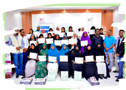
Figure 6 Photo group of graduated trainees